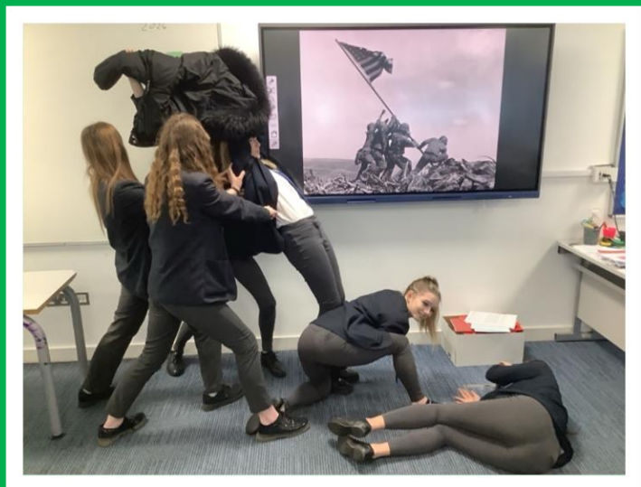
MCR recreating a historical image challenge.