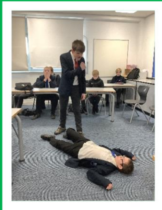
IWH recreating a historical image challenge.