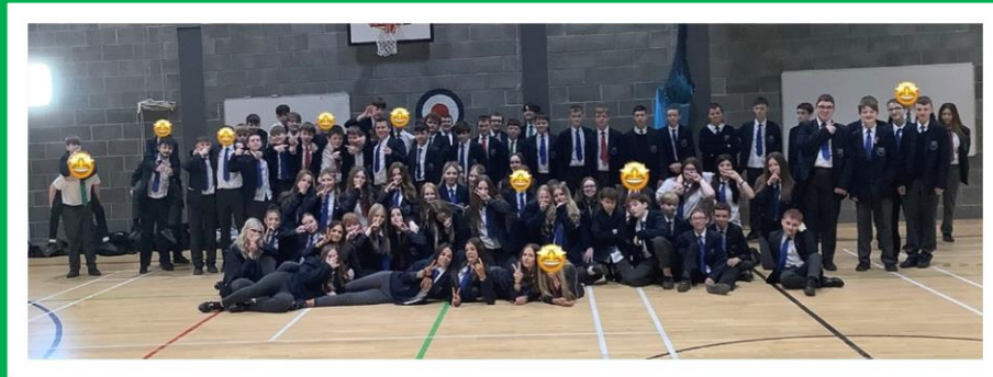
The Amazing Year 9 students.