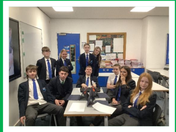
DCR recreating a historical image challenge.