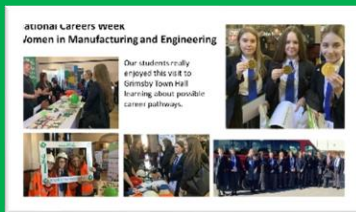
National Careers Week