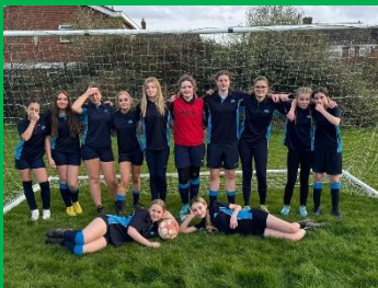
Super star Footballers make it to the Final.