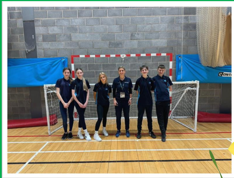
Fantastic Sports Leaders.