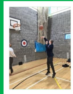
Basketball Challenge Action Shot.